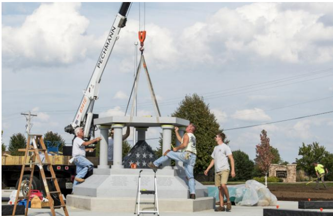
Placing the centerpiece pedestal at Veterans Memorial Park