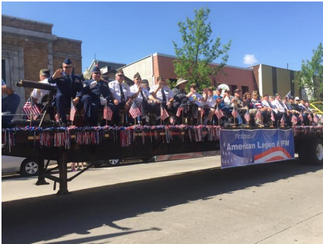
To honor those who served